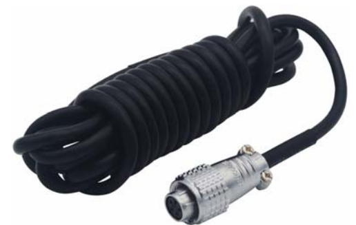
3m cable with mating connector included

• Subject to change without notice / 如有更改,不另行通知